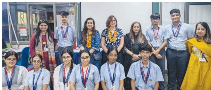
Participants and mentors at the workshop on decoding life

They filtered kiwi's pulp for extracting its DNA, while also understanding the scientific principles behind each step and the use of laboratory apparatus. The extracted DNA was carefully spooled and preserved in small bottles, which students were allowed to take home as a reminder of learning experience. The workshop not only enhanced students' understanding of DNA, but also encouraged curiosity, hands-on learning, and interest in future research opportunities in the field of molecular biology. 🇮🇳