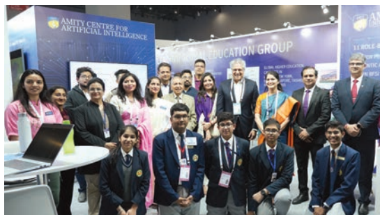
Chancellor, AU Manesar with Amityans