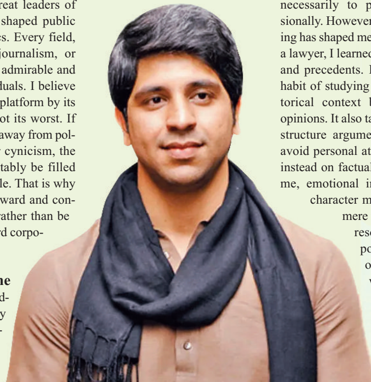
Shehzad Poonawalla, a national party spokesperson

I studied law for knowledge, not necessarily to practice professionally. However, my legal training has shaped me importantly. As a lawyer, I learned to rely on facts and precedents. I developed the habit of studying details and historical context before forming opinions. It also taught me how to structure arguments logically. I avoid personal attacks and focus instead on factual reasoning. For me, emotional intelligence and character matter more than mere intellect. IQ and resources are important, but without character, what we often refer to as EQ, nothing truly matters. If I were not in politics, I would prob-