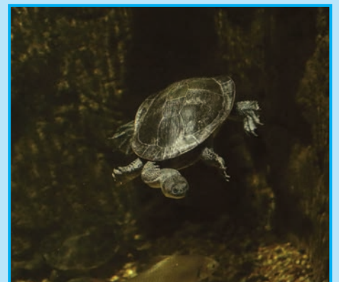
An introvert's corner