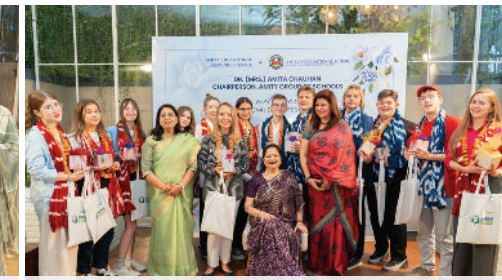
British Club Language School, Russia delegation during welcome reception