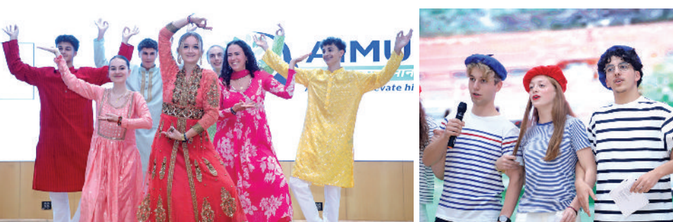
Cultural performances by French delegations at International Cultural Fest