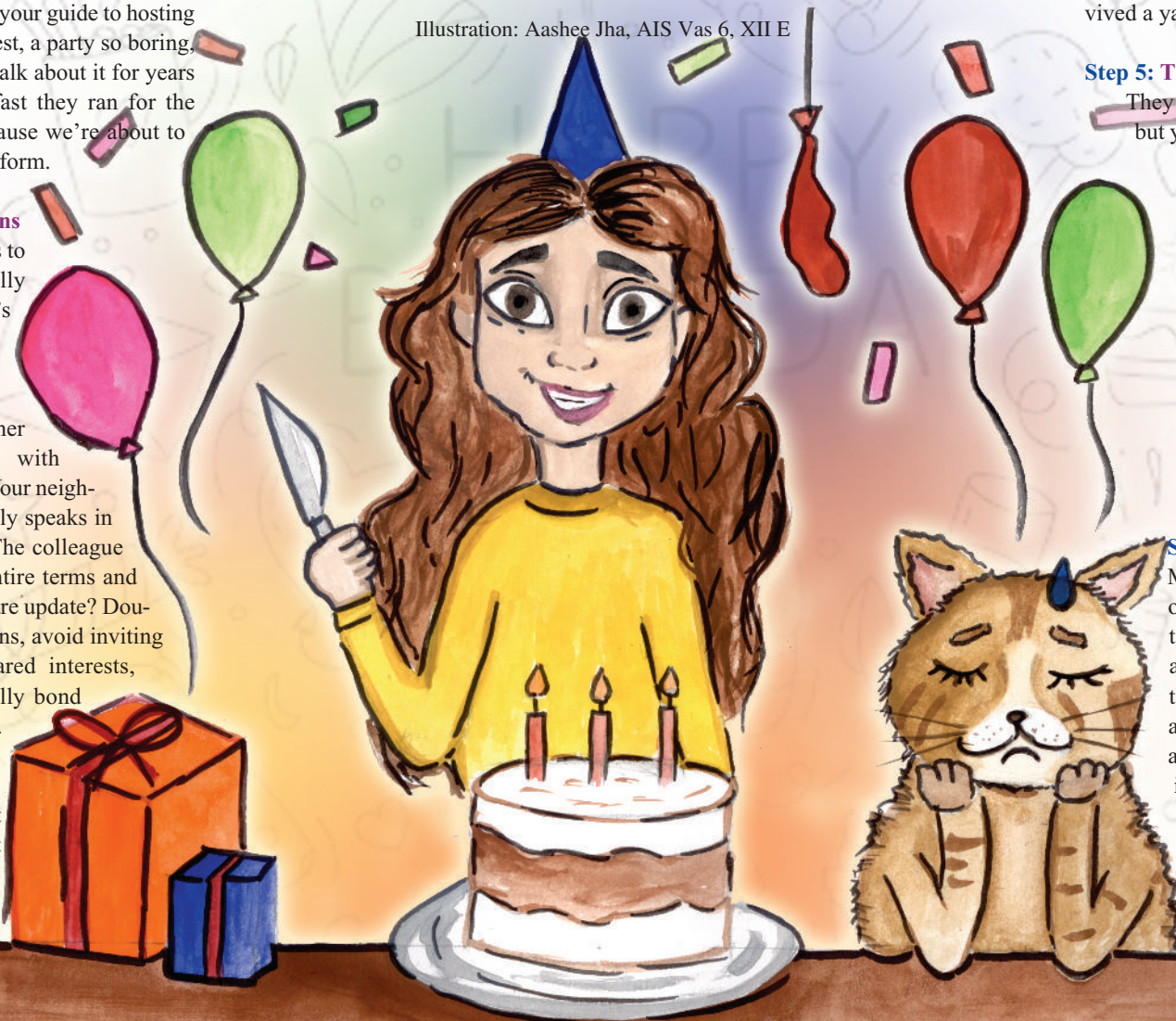
Illustration: Aashee Jha, AIS Vas 6, XII E

Most parties end with a slow fade of guests trickling out. When it's time, you will end it with an abrupt and unapologetic flick of the lights. Begin cleaning up around your guests while they awkwardly stand, trying to decide if you're serious. Remember, it's all about extinguishing even the faintest glimmer of fun. With these tips, you'll be the talk of the town...or at least the whisper of it.