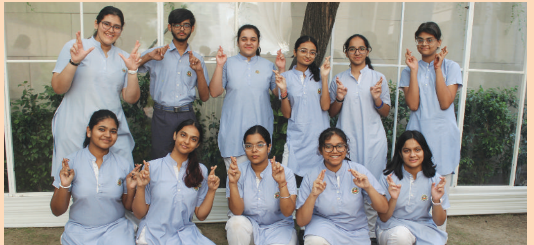
Masters of the pen, dreamers of the page, presenting team AIS Vasundhara 6