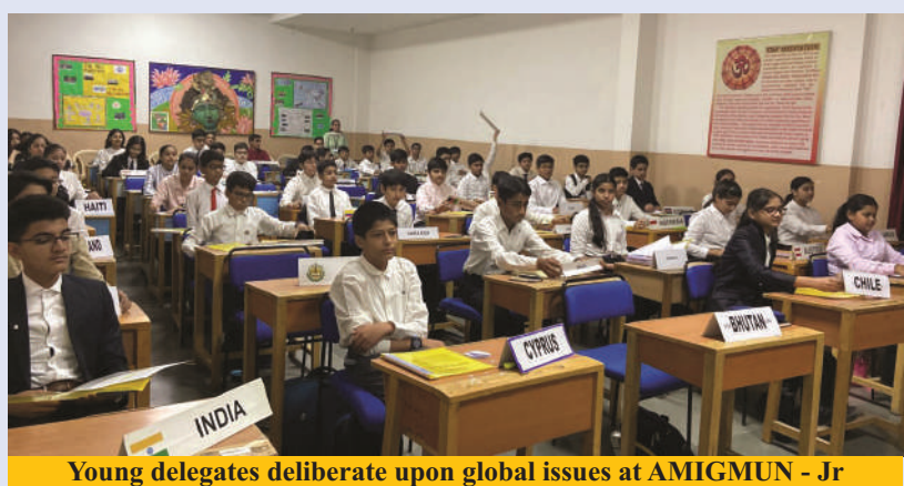
Young delegates deliberate upon global issues at AMIGMUN - Jr

PowerPoint presentations, students displayed the beautiful sights of Meghalaya, the orchids of Arunachal Pradesh, giant monoliths of Unnakoti from Tripura, India's first island district-Majuli, colourful hornbills of Nagaland, Manipuri Rasleela and more. The scintillating presentation of The Seven Sisters resonated with the vision of 'Ek Bharat Shrestha Bharat' and 'Azadi Ka Amrit Mahotsav'.