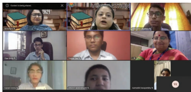
Young wordsmiths of Vocabathon in the battle of wits