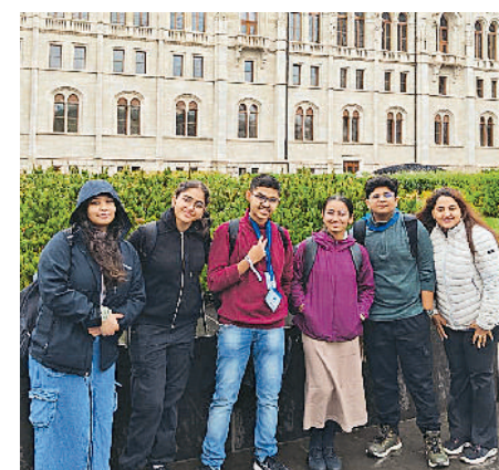
The delegation at Hungarian Parliament House