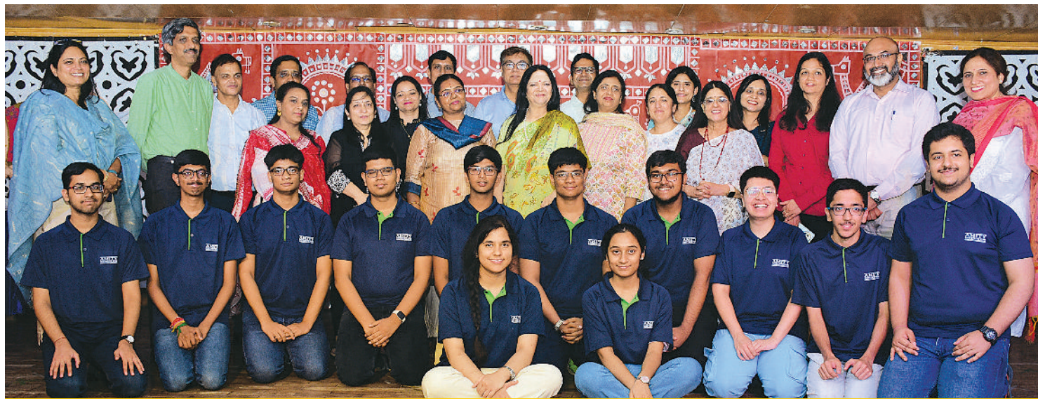
Chairperson with toppers of JEE Advanced and NEET 2024 at the felicitation ceremony