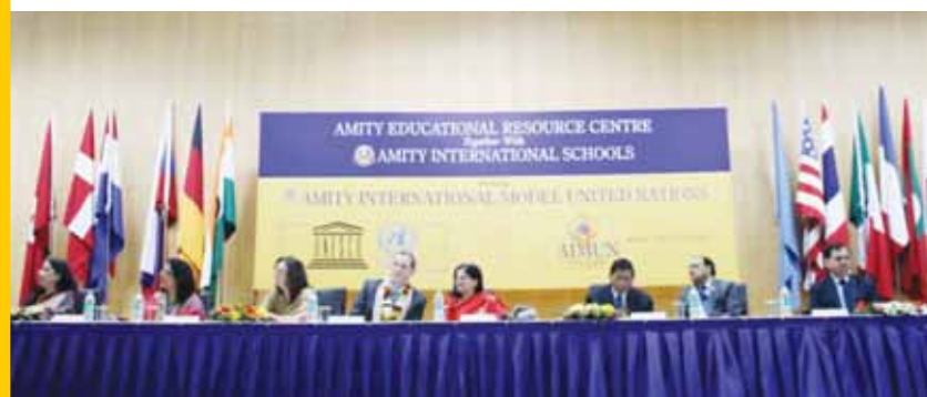
Chairperson along with guests and heads of Amity Institutions