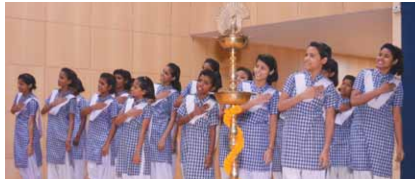
Amitasha students present a welcome song