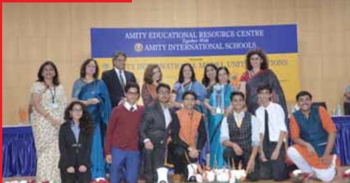
AIS Gurugram 46: Winners of Best Delegation, AIMUN 2017