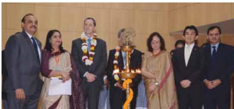
Invoking the blessings of the Almighty with lamp lighting