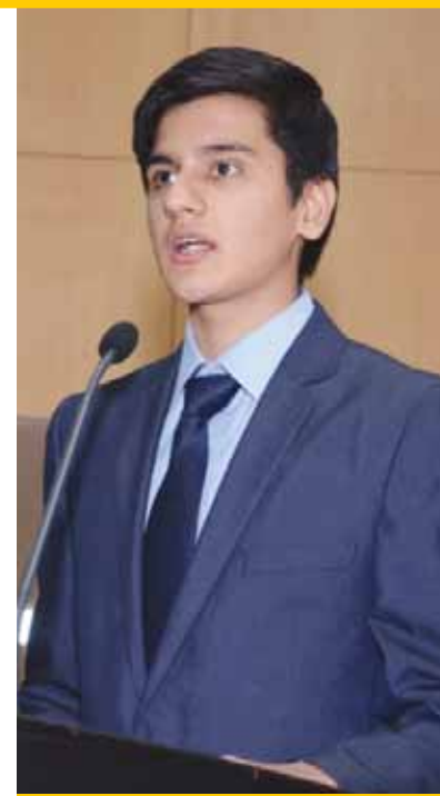
Sec Gen declares AIMUN 2017 open