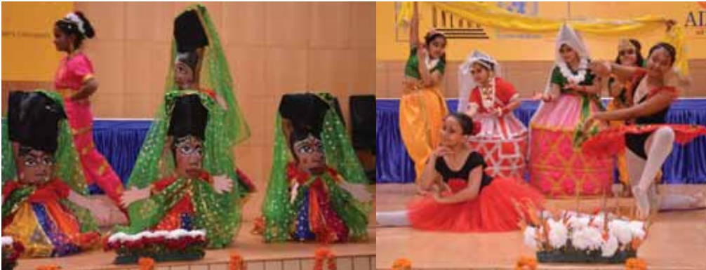
Spectacular performance by AIS Saket