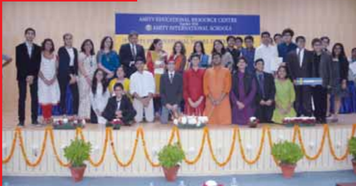
AIS Saket: Winners of Best Delegation, AIMUN 2017