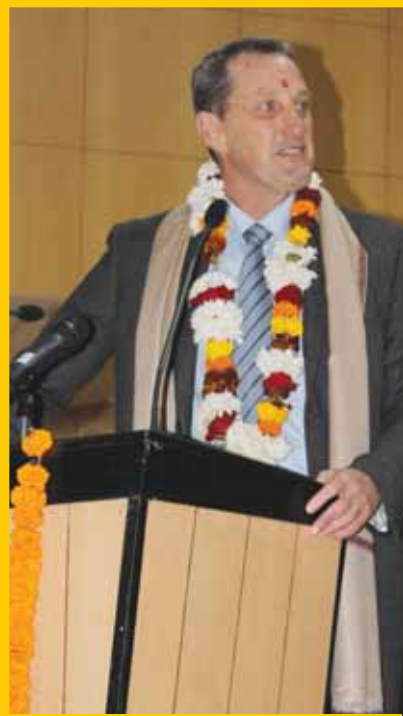
Address by the Chief Guest