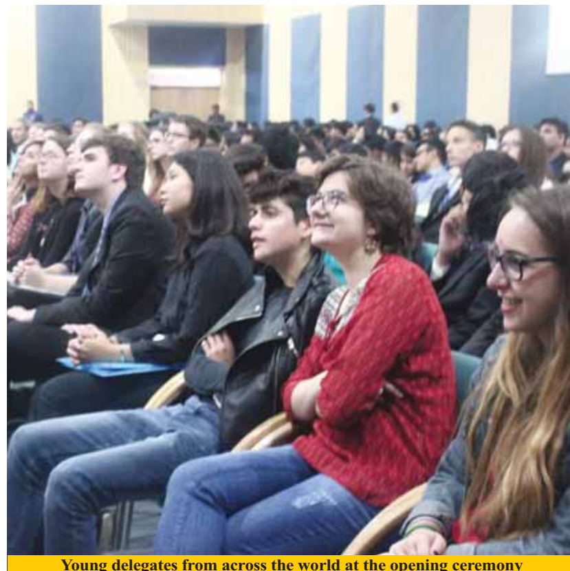
Young delegates from across the world at the opening ceremony