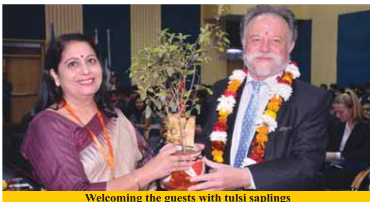
Welcoming the guests with tulsi saplings