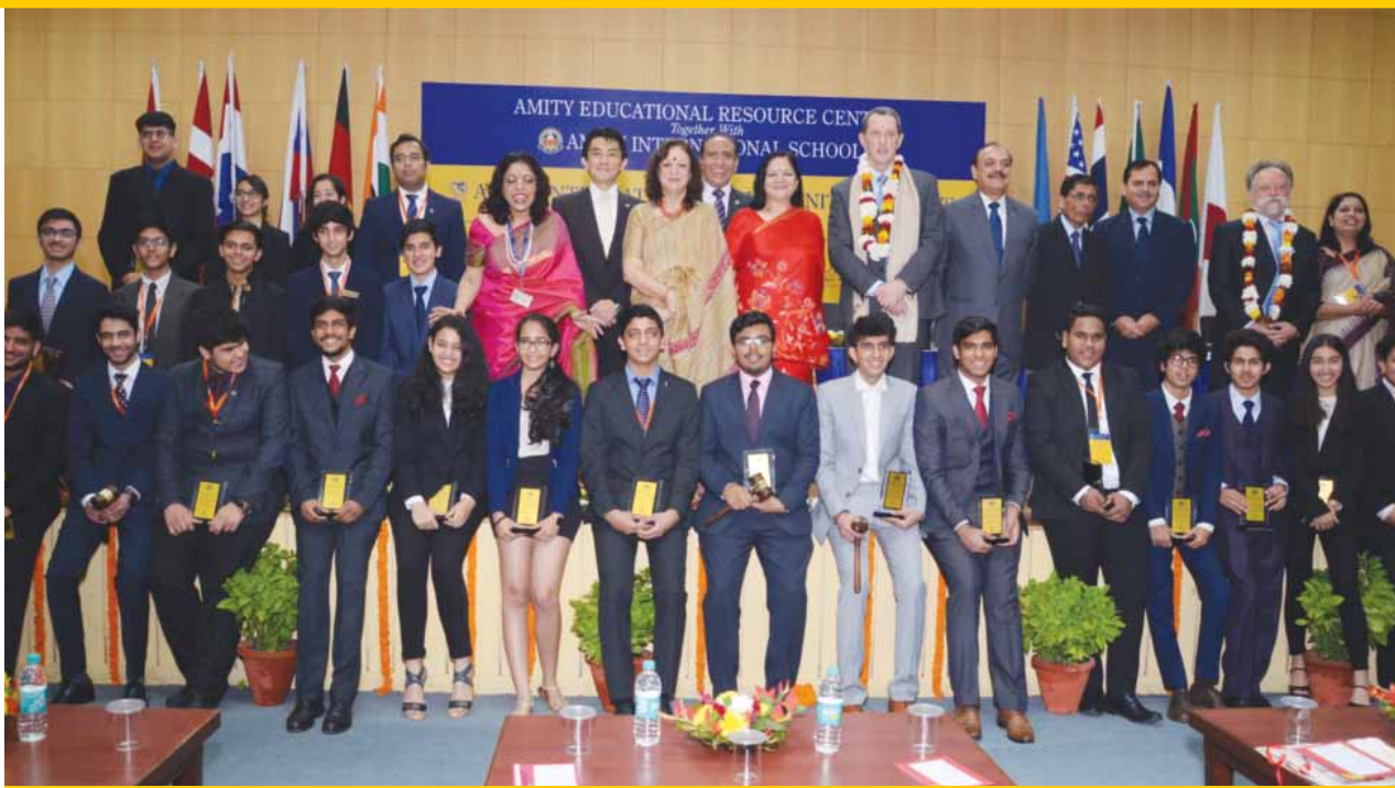
AIMUN Secretariat and Executive Board with Chairperson, guests and heads of Amity Institutions