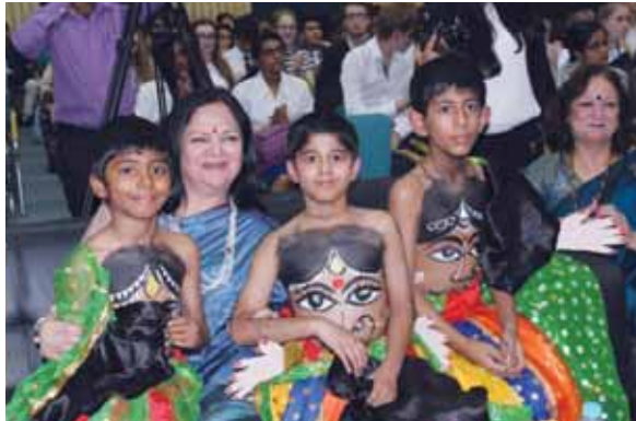
Young performers share a pic with Chairperson