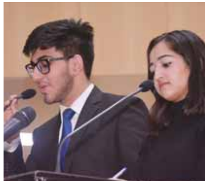
The emcees for the day