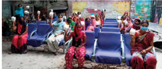
Sarvahitey distributed sanitary products to women in Noida