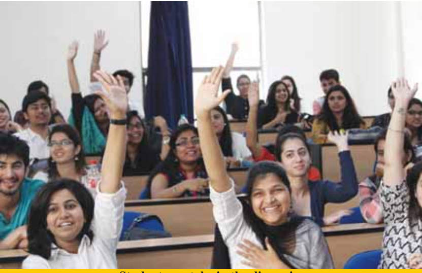
Students partake in the discussion

DAY 2: A Bollywood quiz 'Symphony' was organised by ACGJCR. The quiz