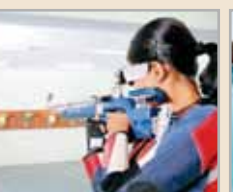
On-campus 15 acre sports complex with numerous outdoor and indoor sports activities