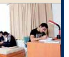
Separate Hostel for Boys & Girls