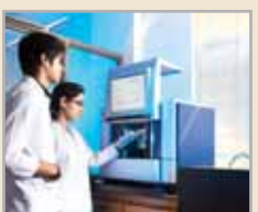
300 hi-tech Labs & Learning Studios in over 60 disciplines