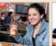
On-campus Cafeteria and multi-cuisine court