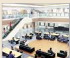
Central Library spread over 56,000 sq. ft