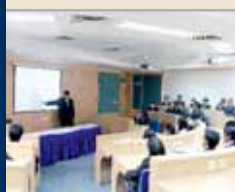
Amphitheatre style AC classrooms