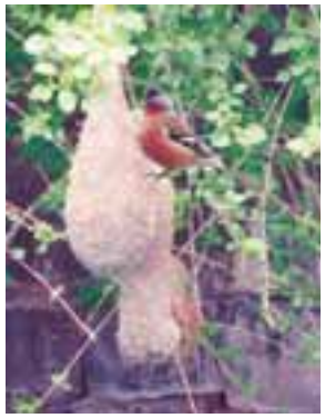
Winged wanderer, P 7