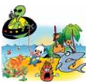
Topsy turvy, P 4