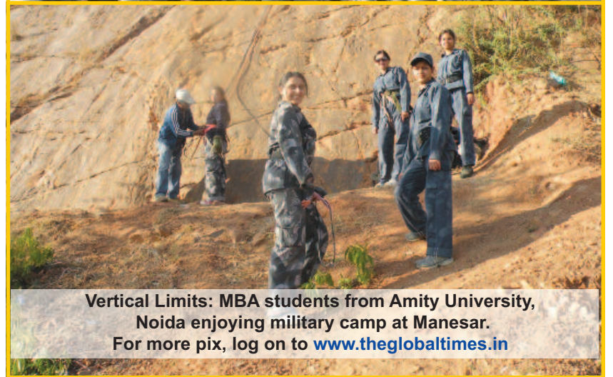
Vertical Limits: MBA students from Amity University, Noida enjoying military camp at Manesar. For more pix, log on to www.theglobaltimes.in