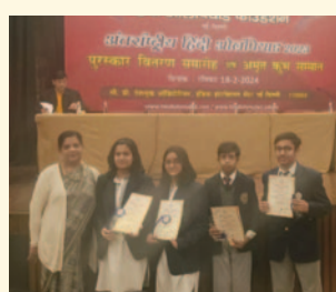
School principal with winners