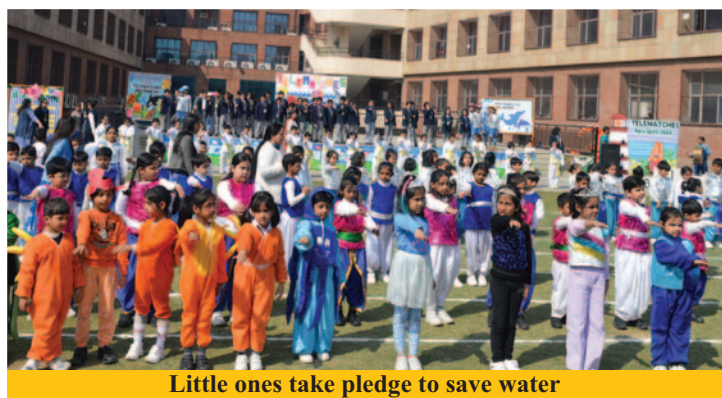
Little ones take pledge to save water

sports achievements of the school. The young ones emphasised on water conservation and raised awareness about SDG 14 through their creative presentations and enthusiastic participation in aquatic-themed activities like smart walk, drills, dolphin race, frog race, and sea-horse race. Aquaspark concluded with students taking a pledge to save water followed by felicitation of proud winners by sports advisor, Amity Group of Schools. Gf