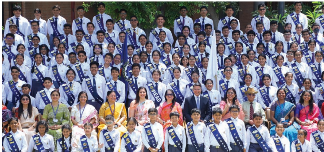
Newly elected student council with esteemed guests at the ceremony

Young Leaders Take Charge Of Their Duties