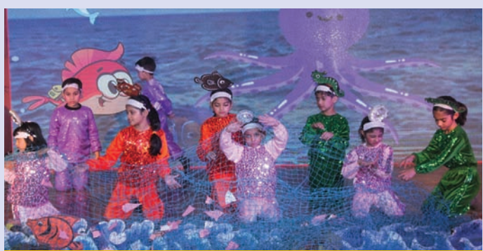
A glimpse of the dance-drama presented by the students

safety and security; a dual-authentication vehicle access system and method for utilising RFID and fingerprint recognition and a helmet assembly with sensing means. A wireless charging system for electric vehicles using road integrated copper coils and solar power by Anuttam Das (XII), Lakshay Devgan (XII), Atharv Kala (XII), Arunabh Dasgupta (XII) and Bhavya Yadav (XII) from AIS MV was another project awarded with a patent. Archit Roy (VI) from AIS Noida received patent for designing an automatic sensor activated, energy saving mat for lights and fans control.