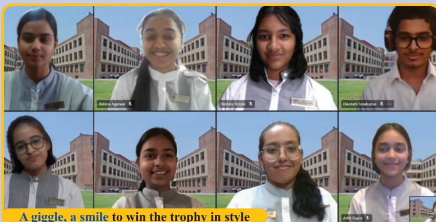
A giggle, a smile to win the trophy in style