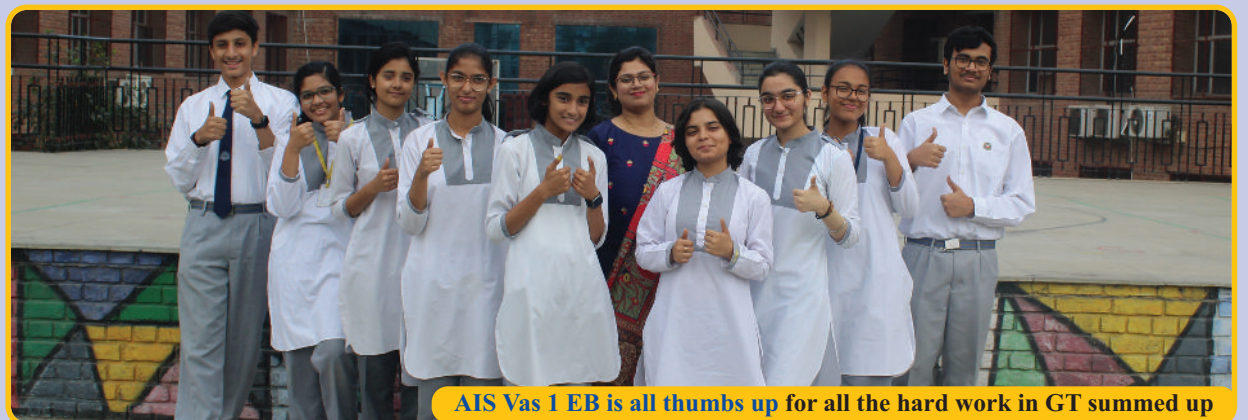
AIS Vas 1 EB is all thumbs up for all the hard work in GT summed up