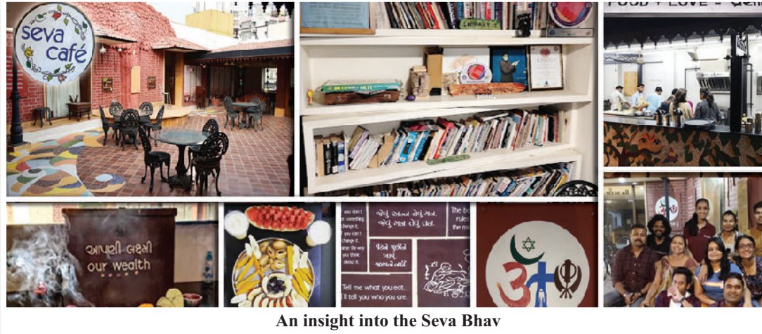
An insight into the Seva Bhav

Taking inspiration from Gandhiji’s ideology ‘service before self’, the café has been functioning since 2005. The inspiration is conspicuous in Gandhiji’s picture that hangs in the café where he can be seen while cooking and serving