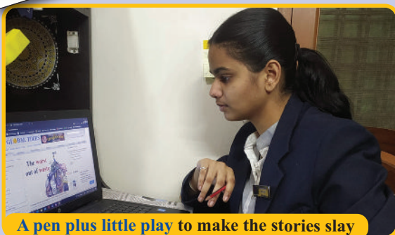
A pen plus little play to make the stories slay