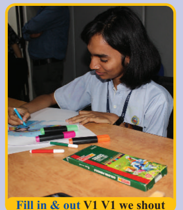
Fill in & out V1 V1 we shout

For more pictures, log on to www.facebook.com/theglobaltimesnewspaper or www.instagram.com/the_global_times