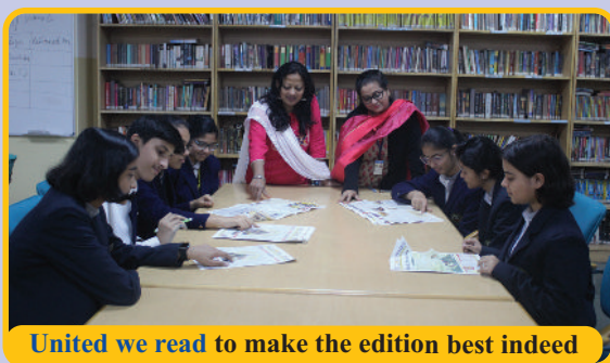
United we read to make the edition best indeed