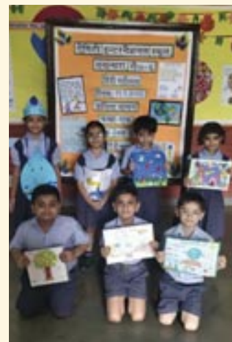
The young poets of Class I

Students of Class I and IV observed Hindi Diwas on Sept 11 and Sept 14, respectively by conducting a special assembly. As part of it, they recited poems, shared meaningful thoughts, and staged nukkad natak , all in Hindi to emphasise the language's importance in our lives and in the development of our nation. They also spoke about the crucial role that Hindi will be playing in uniting people from diverse linguistic backgrounds as part of the New Education Policy.