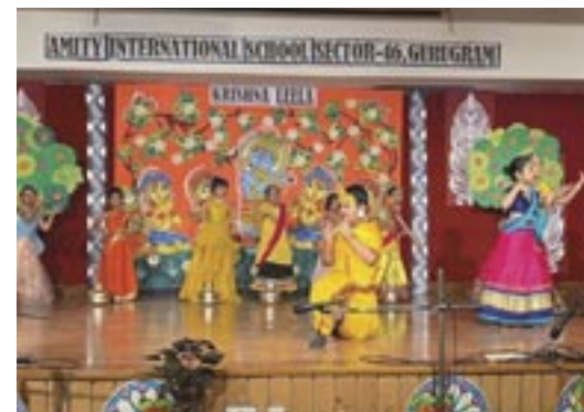
Krishna Leela presented by AIS Gur 46