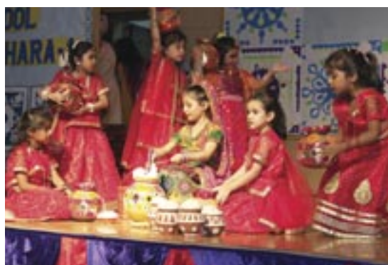
Little gopis of AIS Vasundhara 1

Chairperson's address, wherein she expressed her deep love and appreciation towards the teachers of Amity for shaping the youth. The ceremony concluded with announcement of the annual Teachers' Day Essay Contest 2022-23 winners, which saw essays penned by over 1500 Amity teachers pan India on topics: 'Modern teaching methodologies must be balanced with sound moral values for the holistic growth of a child' and 'Does the teaching profession require role models? Discuss your opinion with personal examples and experiences'. Winners of the contest were rewarded with a trophy, a stole and a cash prize of INR 5000 each.