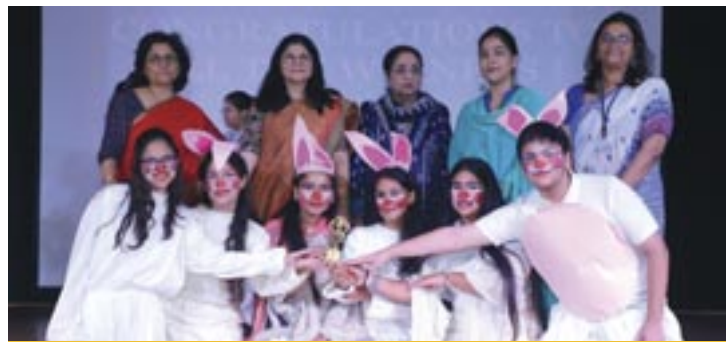
The cheerful expressions of victory

Theatrical Fest Celebrates Emerging Talent