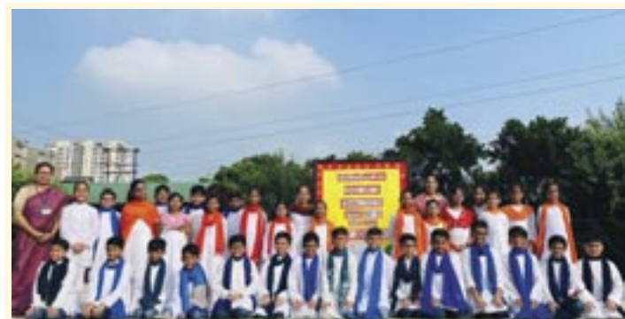
Nukkad natak artists of Class IV smile for the lens