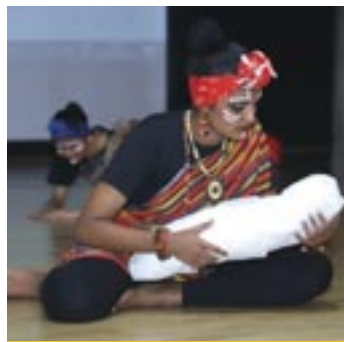
An act of kindness on stage