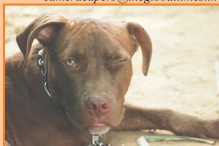
In the blink of an eye