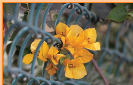
Blooming through barriers

Send in your entries to cameracapers@theglobaltimes.in