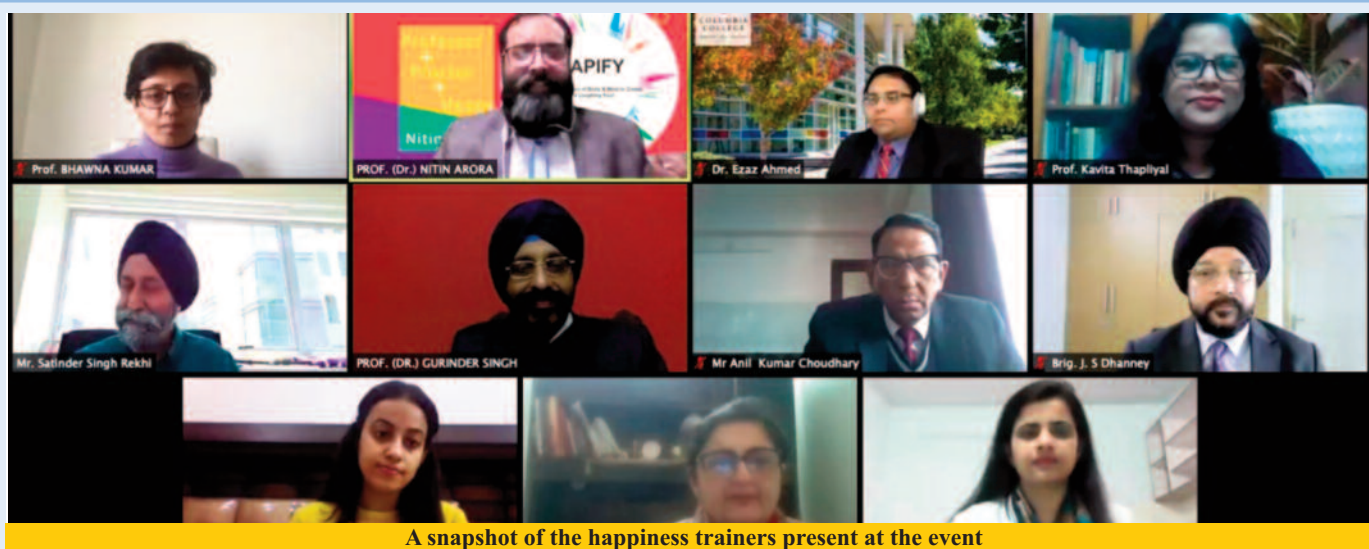
A snapshot of the happiness trainers present at the event

The world of music is an uncharted territory, full of opportunities that combine music with many other fields such as psychology, biology, sociology, journalism, science and many more. As options are expanding, we must expand our horizons and let ourselves go where the symphonies take us. 🎵