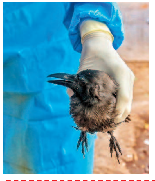
The most CCTV scrutinised city globally

sistent with the maintenance of the cameras.