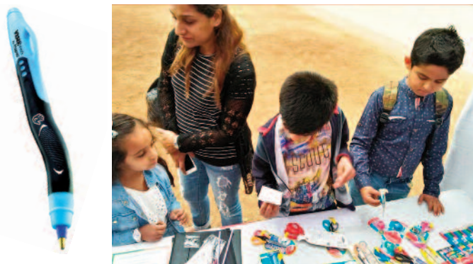
Left handers' gel pen (L) kids checking out products