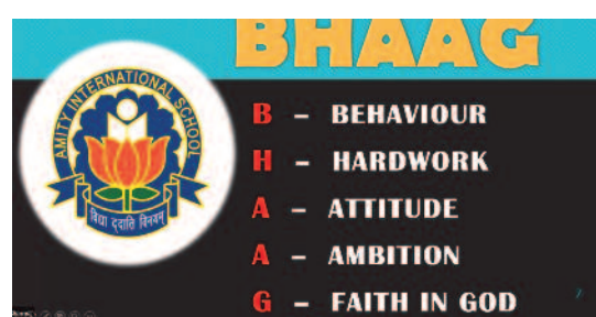
AIS MV shares the success mantra 'BHAAG'

parents about the curriculum, rules and regulations, teaching methodologies, assessment pattern, co-curricular activities and various international exchange programmes organised by Amity Group of Schools. They were also apprised with Amity's motto 'Modernity blends with traditional values' to nurture critically thinking, creative and compassionate global citizens of the 21st century who can build a happy nation and a happier world. 🇮🇳