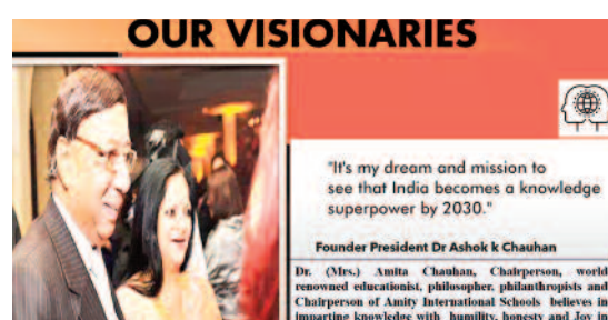
AIS Gur 46 shares the vision of Founder President

Creating Synergy Between School And Parents Through Orientation