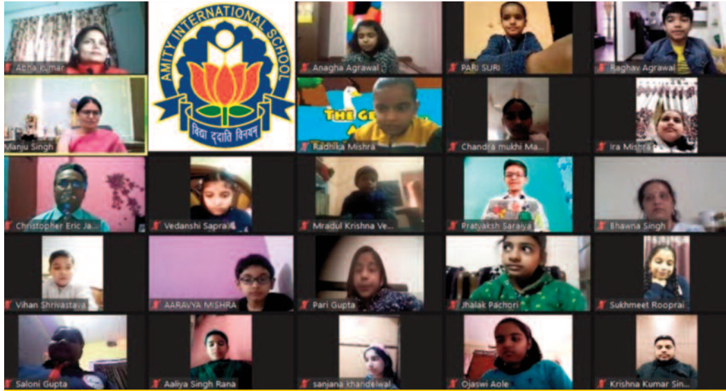
Children narrate and listen to various tales during the 'Art of Storytelling' competition