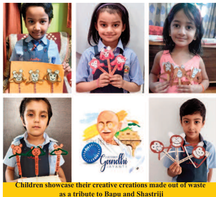
Children showcase their creative creations made out of waste as a tribute to Babu and Shastriji