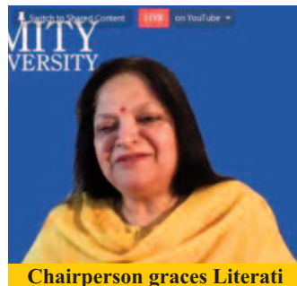
Chairperson graces Literati