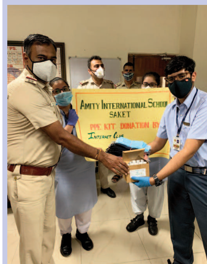
Members of Interact club donate PPE kits to the police officers