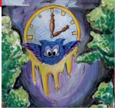
Illustration: Dhimant Badan, AIS PV, XI G

The night is gone; the sun is in the sky We all are awake, now owls take rest New day starts with new hope and zest G