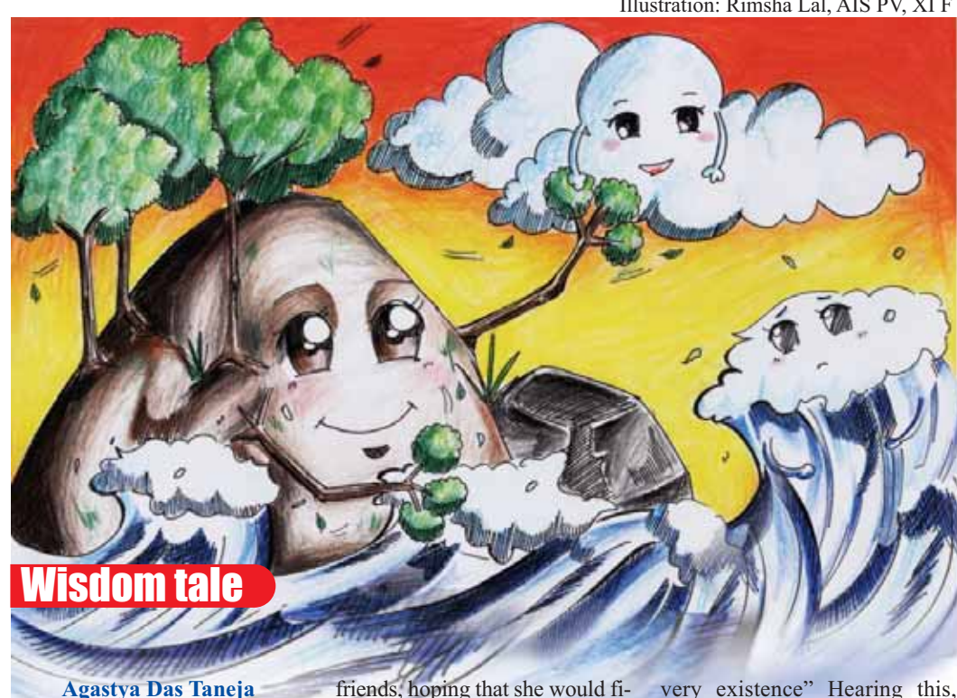
Illustration: Rimsha Lal, AIS PV, XI F