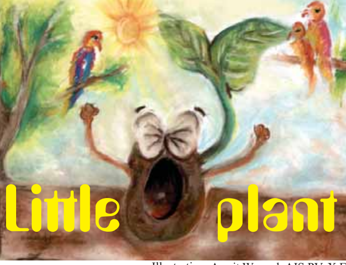
Illustration: Amrit Warwal, AIS PV, X E