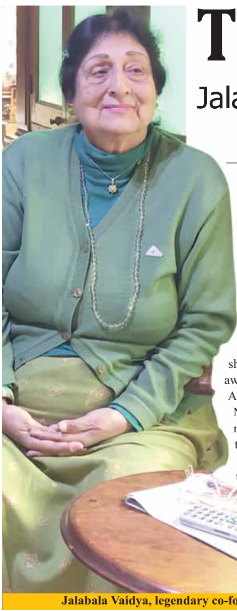
Jalabala Vaidya, legendary co-founder, Akshara Theatre

Be focused. It's very easy to get distracted but you need to train your mind to achieve your goals. Whether you want to be a teacher, a doctor, or anything else, you need to learn how to be focused. 🇮🇳