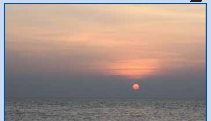
Promise of new hopes