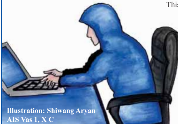
Illustration: Shiwang Aryan AIS Vas 1, X C

This digital world is a weird place Where friendships break and embrace If we remember to keep it at bay Our minds might see the light of day