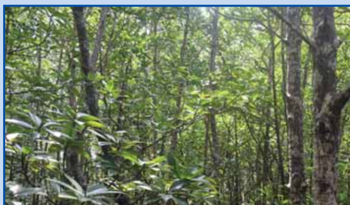
Nowhere to be found