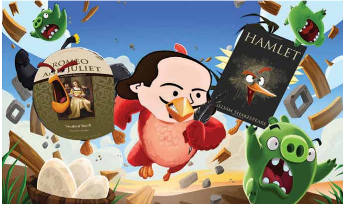
Graphic: Aryaman Sen, AIS Vas 6, X D

The characters that lived in my pages weren't something you could cast off as protagonist or as the enemy, but were