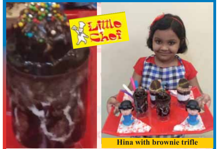
Hina with brownie trifle