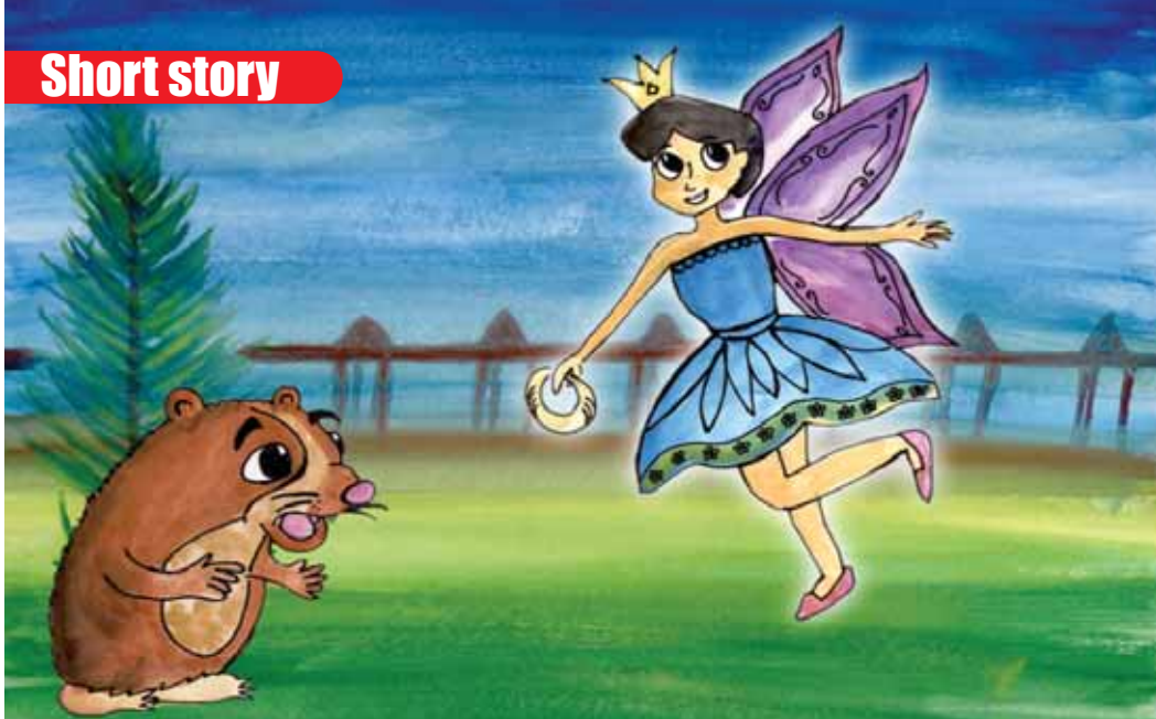
Illustration: Srijan, AIS MV, VIII A