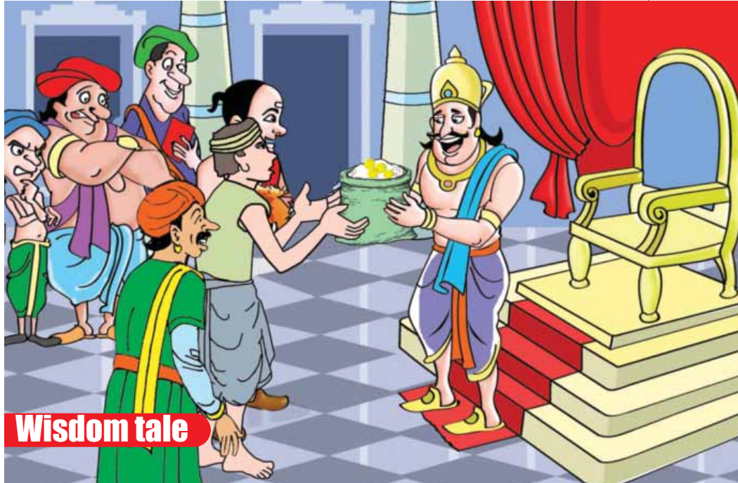
Illustration: Ravinder Gusain, GT Network