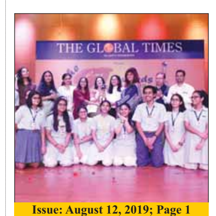
Dear Editor, This is with reference to GT Awards