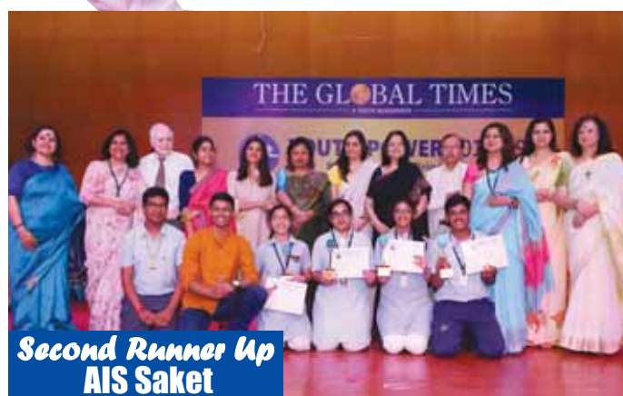
Second Runner Up AIS Saket