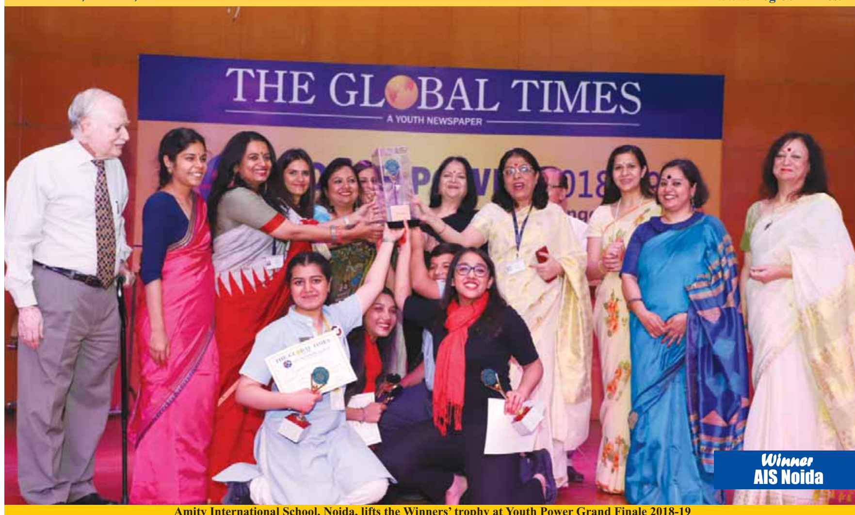
Winner AIS Noida