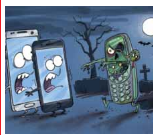
Kabhi 'no' nahi 'kia', P4