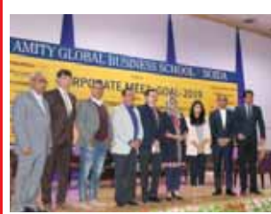
A business of ideas, P3