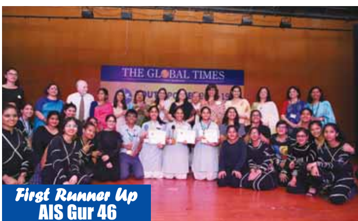
First Runner Up AIS Gur 46