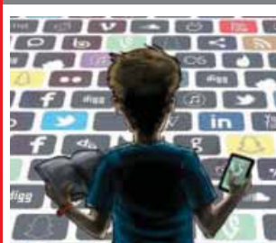
Internet lessons, P6