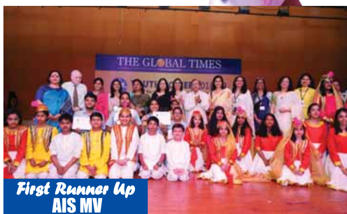
First Runner Up AIS MV