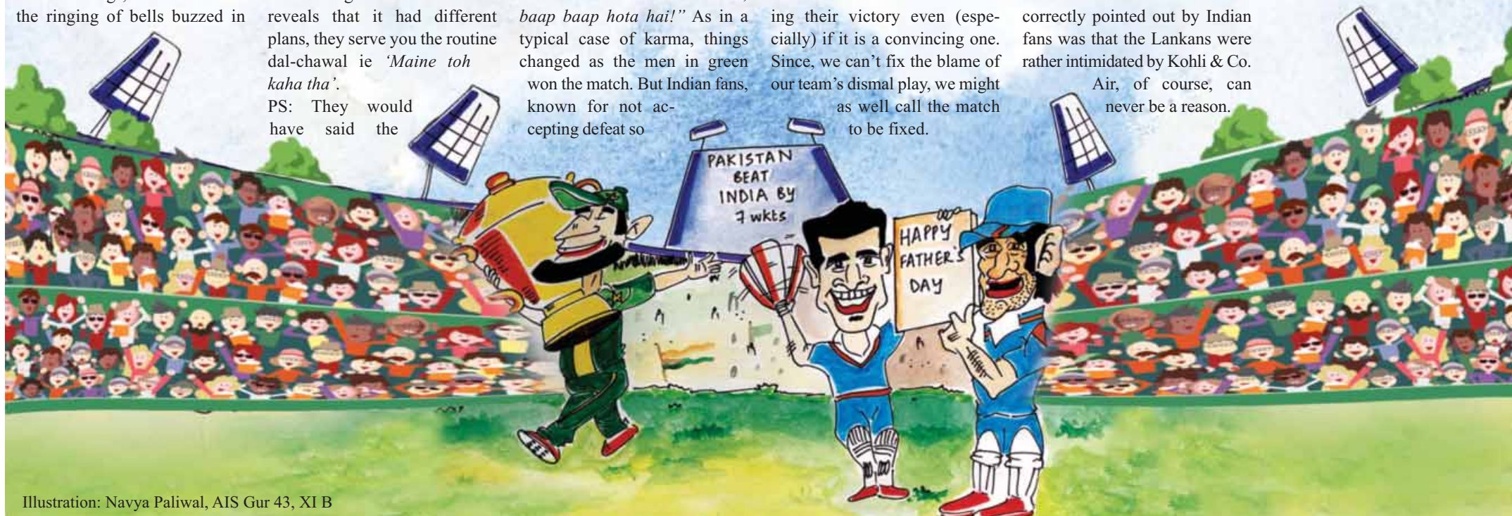
Illustration: Navya Paliwal, AIS Gur 43, XI B

In yet another tryst with our southern neighbour, Team India managed to score a meagre 102 runs. But Indian fans, again not the ones to accept defeat, simply trolled the event away saying that the players were in a rush to make it to the captain’s wedding and that the Sri Lankan team could enjoy the win as a gift in lieu of the same.