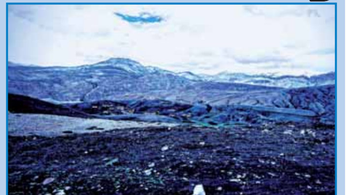
Blue is the coldest colour