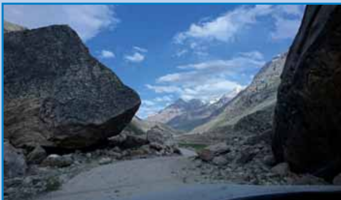
Making way, moving on