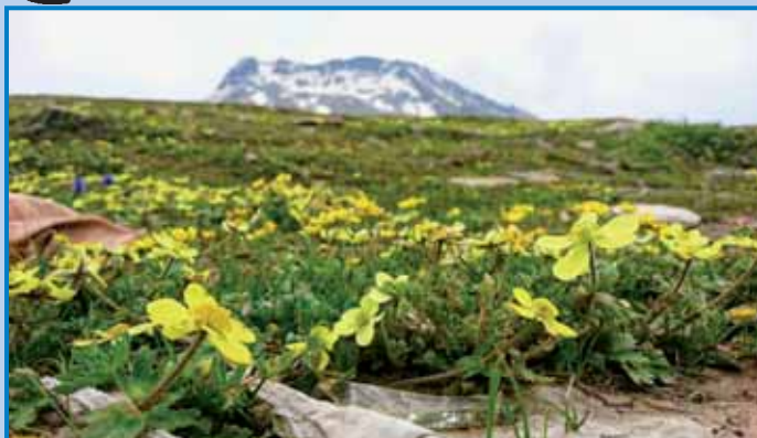
Go where the flowers bloom