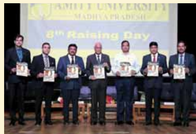
The Amitians' monthly newsletter released on the occasion

All in all, the event was packed with all ingredients of a lovely evening full of entertainment. G.U.