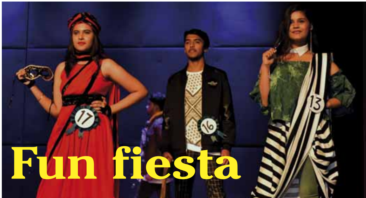
Participants walk the ramp at the annual fashion festival based on the theme 'Colour Crush'