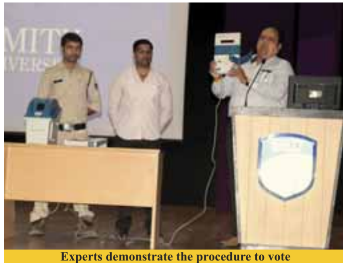
Experts demonstrate the procedure to vote