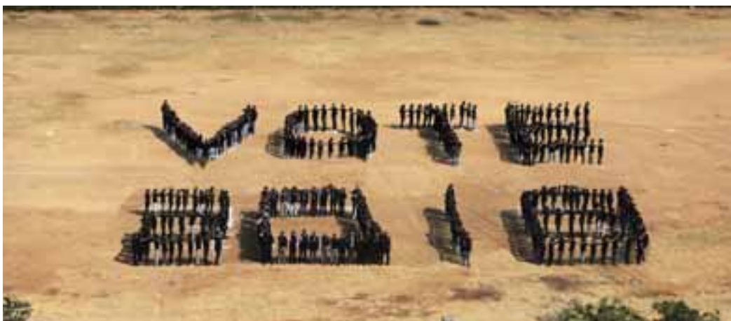
Students of AUMP create a human chain to urge everyone to vote