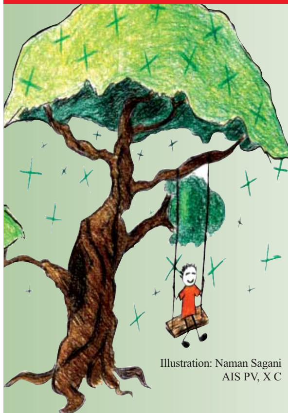
Illustration: Naman Sagani AIS PV, X C

Set all the negativity free It will fill you with glee!