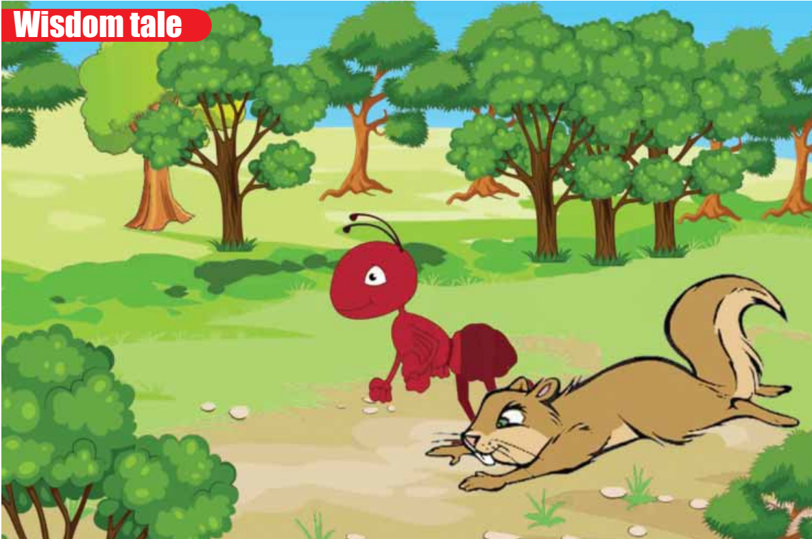
Illustration: Ravinder Gusain, GT Network