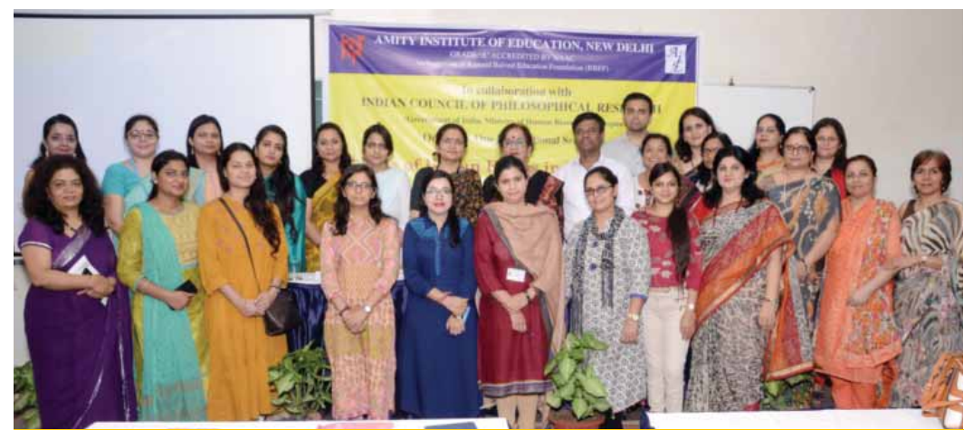
Dignitaries, faculty members and participants at the national seminar