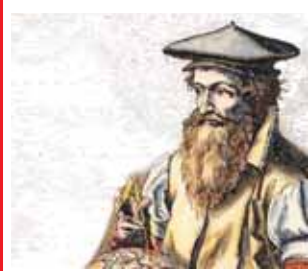
Mapping it right, P4