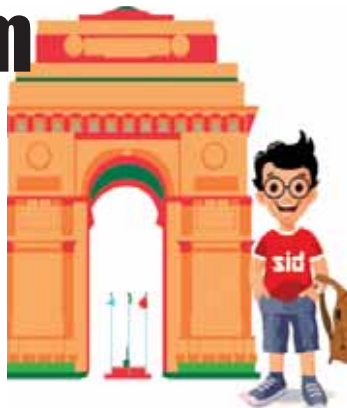
My mother was screaming "It is not a weekend."