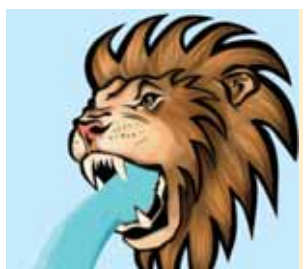
I am Indus, P7