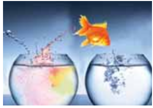
Changing CBSE, P3