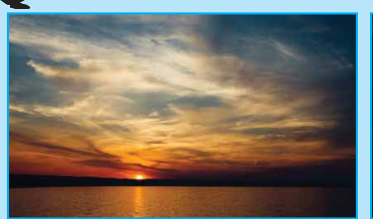
When sky, earth and water paint horizon in unison