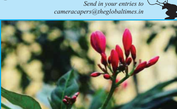
My closed petals await to colour the canvas of world