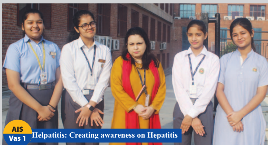
AIS Vas 1 Hepatitis: Creating awareness on Hepatitis