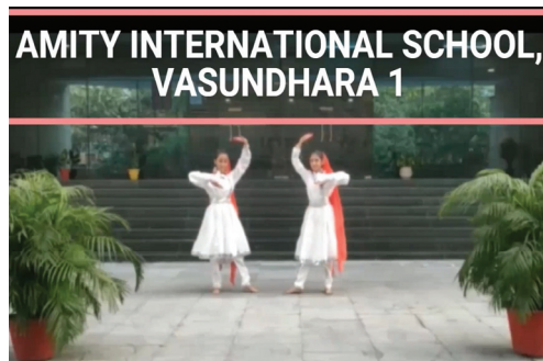
Kathak dance performance by AIS Vas 1