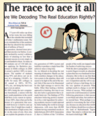
Issue: Oct 17, 2022, Page 6