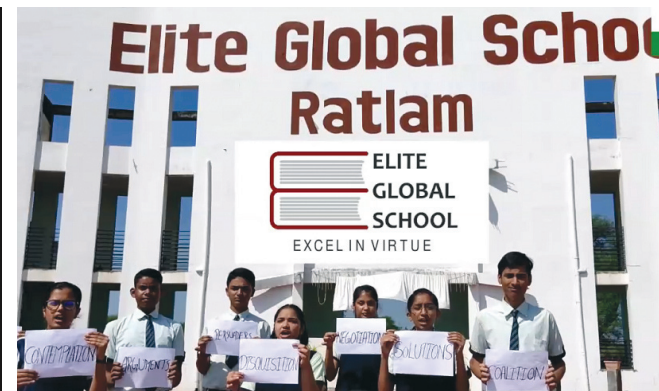
A video presentation by Elite Global School