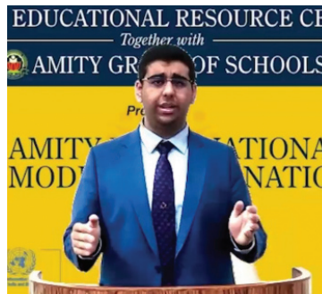
Sec Gen declares AIMUN open