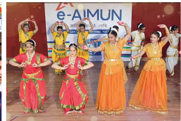
Dance performance by AIS Gur 46