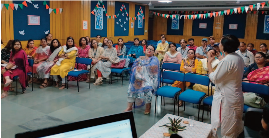
The session in progress with academic experts in attendance

A Seminar For Faculties To Adopt New Teaching Methods