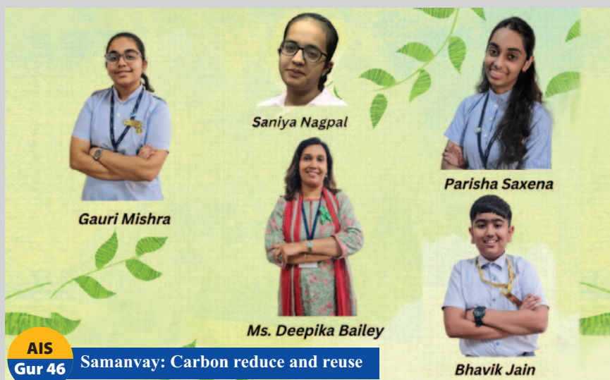
AIS Gur 46 Samanvay: Carbon reduce and reuse