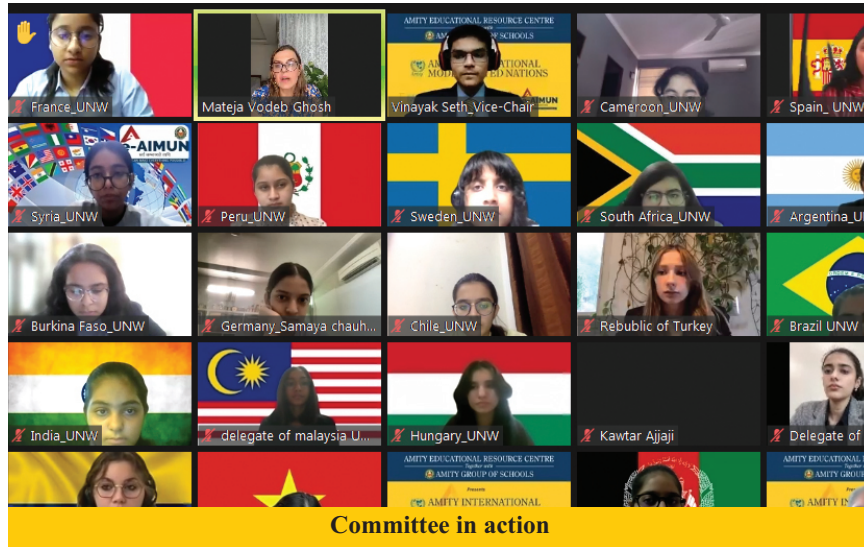
Committee in action

With Promises Of Changing The World And Actions To Support It, Here's Bidding Adieu To The 15th Chapter Of AIMUN