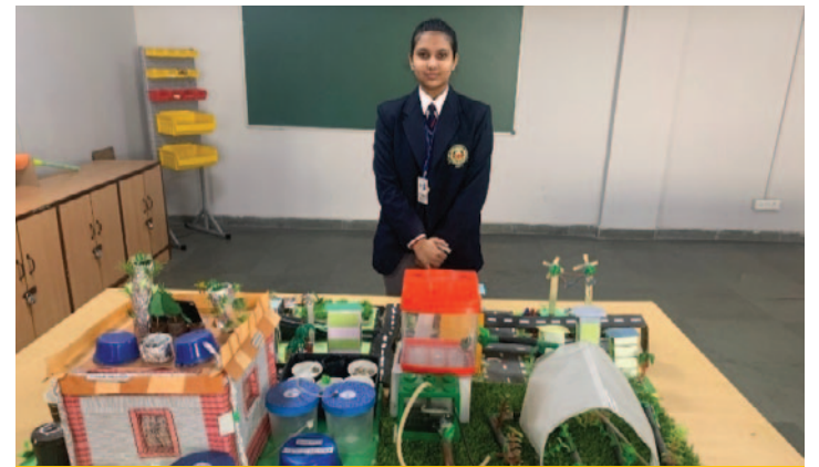
A prototype of the 'Next-Gen City' designed by Adite

nised. The programme concluded on an emotional note where the grandparents shared stories about their lifetime experiences and also sang with their grandchildren. G I