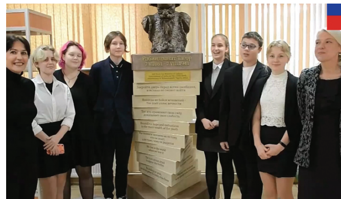
Delegation from Rabindranath Tagore School St Petersburg