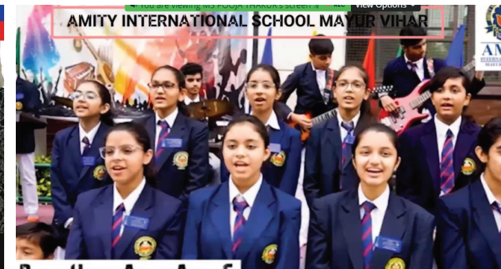
A musical treat by AIS MV