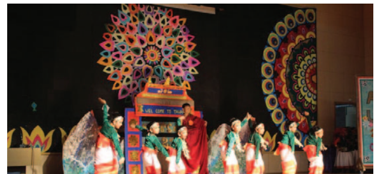
Students perform dance at the cultural fest