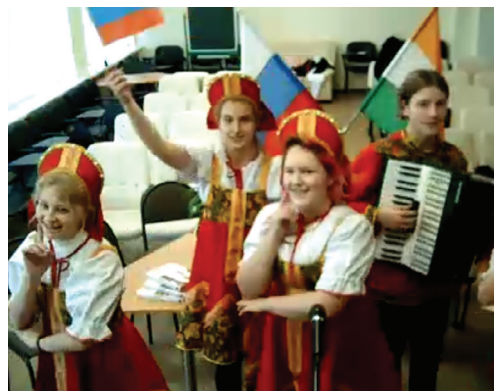
Russian delegates perform live