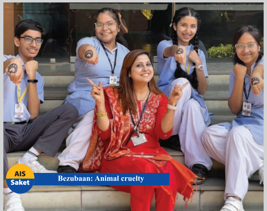
AIS Saket Bezubaan: Animal cruelty