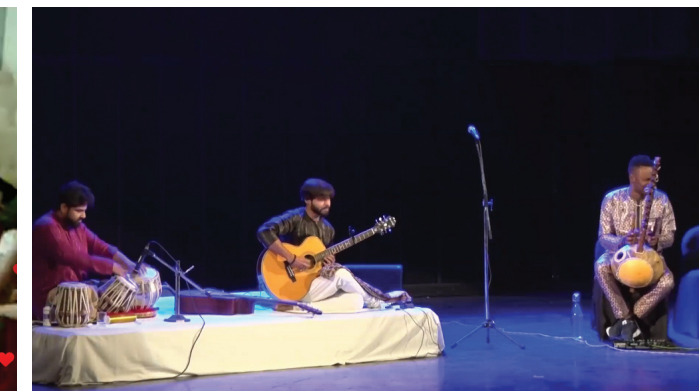
Alliance Francaise on the instruments