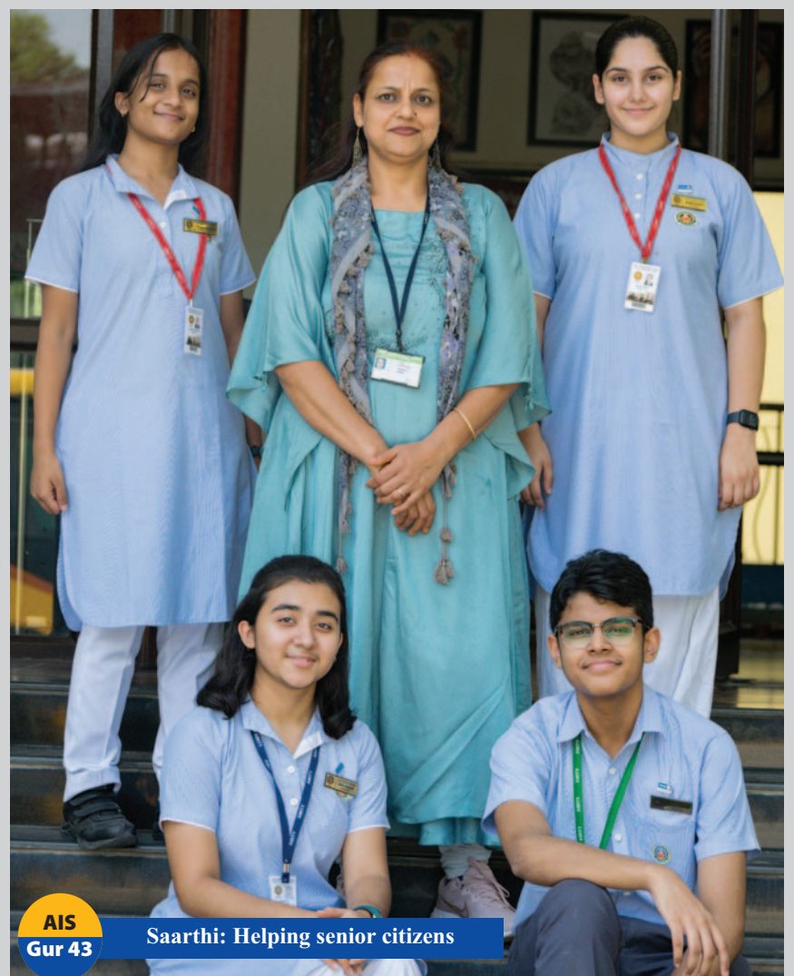
AIS Gur 43 Saarthi: Helping senior citizens