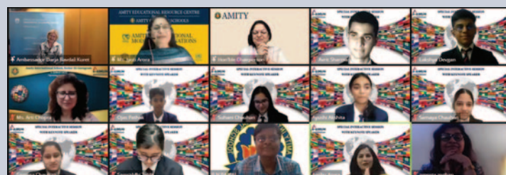
A glimpse from the enlightening conversation

This is a delicate question and all the countries who respect human rights and women's rights need to handle this together. There are many UN resolutions that can be implemented but the question is how