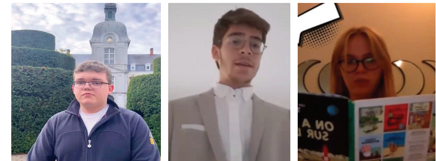
Presentations by France & Belgium at the cultural festival