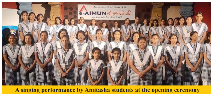
A singing performance by Amitasha students at the opening ceremony