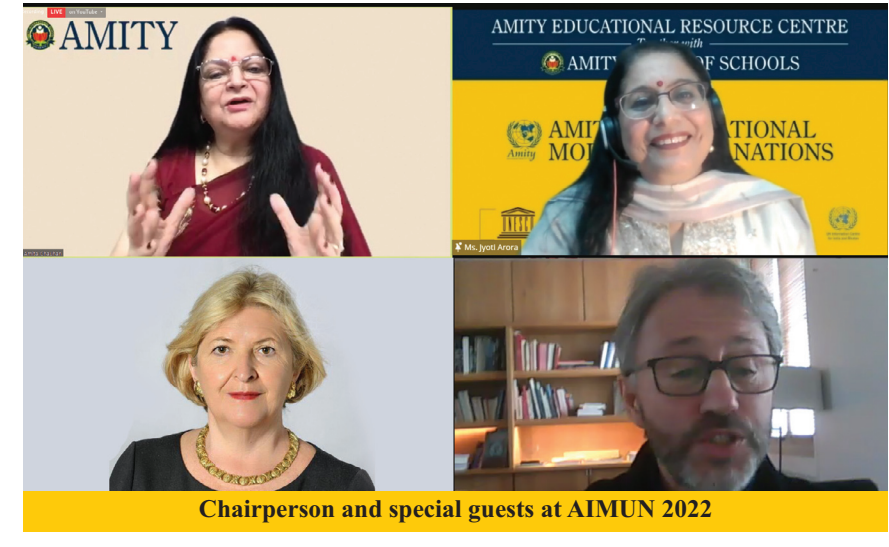
Chairperson and special guests at AIMUN 2022