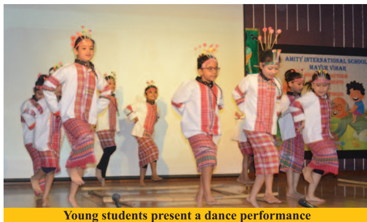
Young students present a dance performance

To celebrate and acknowledge the role of grandparents in the life of children, the young Amitiens of Class I-III celebrated Grandparents Day on September 9, 2022. The programme commenced with the auspicious lamp lighting ceremony amidst the chanting of shlokas. School principal Meenu Kanwar, welcomed the grandparents and addressed the august gathering by touching upon the presence of elders in every home. She also emphasised how the young ones should have values like respect, love, and care for the elderly. To strengthen the bond between