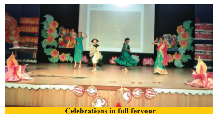
Celebrations in full fervour