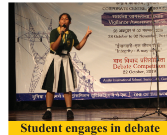
Student engages in debate