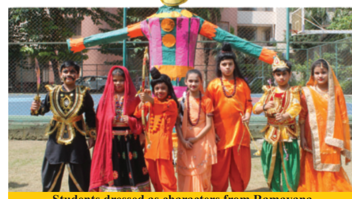
Students dressed as characters from Ramayana