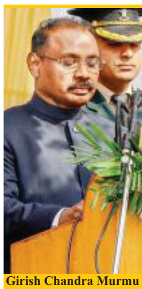
Girish Chandra Murmu